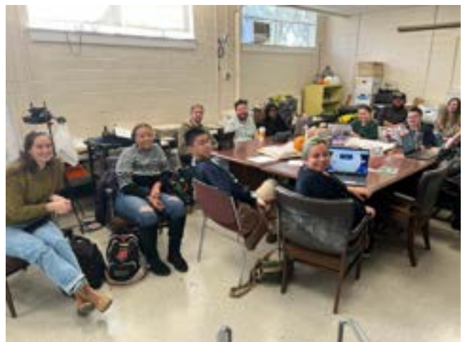
Members of the Archaeology Club