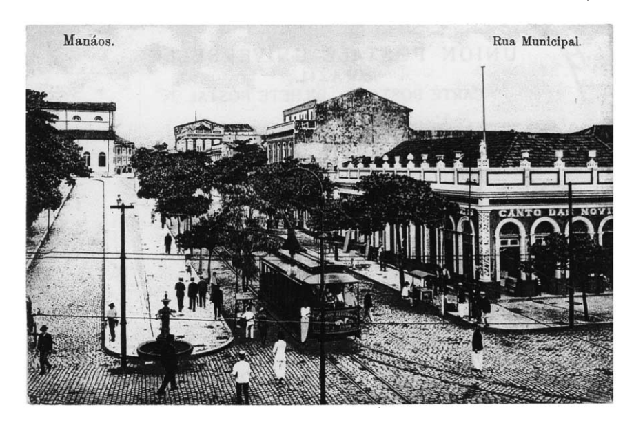
Figure 2. Manaos. Rua Municipal

ground (Figure 3). The streets are adorned in carnival decoration, giving a sense of gaiety. The avenue is lined with commercial enterprises, and tram rails and electric lines cross the photograph. The dome of the opera house (Teatro Amazonas) can be seen in the distance.