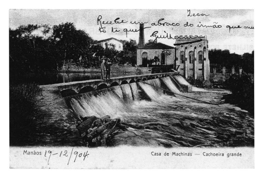
Figure 6. Manaos. Casa de Machinas-Cachoeira Grande

In keeping with the message of technological advancement and modernity, one of the most prevalent themes is electricity. Many postcards in the collection display the engineering triumphs of electrical streetlights, transmission lines, or turbines, as icons of civilization. For example, Figure 6 shows a hydroelectric dam alongside a Tuscan-