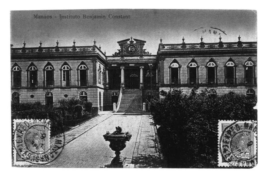
Figure 8. Manaos. Ed. Benjamin Constant

city's inhabitants. Aside from the one exceptional card, the masses of non-European workers are noticeably absent. Wealth in Manaus may have been abundant, but it was not well distributed. The rubber boom had amplified the great disparity between the small number of elites, many of whom were European-born or of European descent, and the majority of the city's inhabitants. The latter were predominantly poor, and often native American, Afro-Brazilian, or mestizo. Missing from the sanguine depictions of prosperity and progress were the vast bulk of Manaus residents—members of the working classes—who were unskilled, illiterate, and overwhelmingly nonwhite.