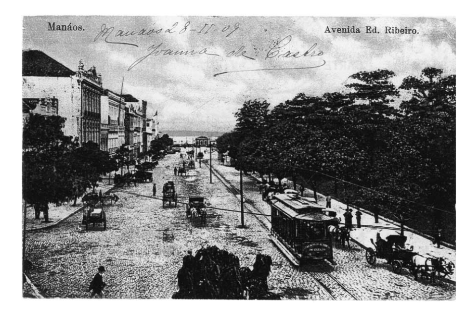
Figure 5. Manaos. Avenida Eduardo Ribeiro

The 1906 card (Figure 4) shows the same view of Eduardo Ribeiro Avenue with clusters of pedestrians in the center and lower right. Along the left side we see commercial establishments with benches, small ornamental trees, and street lamps. The tram tracks run across the center of the card, but no tram is shown. This card is ex-