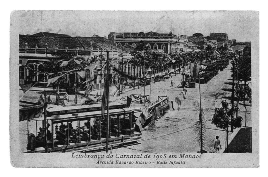
Figure 3. Manaos. Lembranca do Carnaval de 1905 Manaos. Av. Eduardo Ribeiro.

ground (Figure 3). The streets are adorned in carnival decoration, giving a sense of gaiety. The avenue is lined with commercial enterprises, and tram rails and electric lines cross the photograph. The dome of the opera house (Teatro Amazonas) can be seen in the distance.