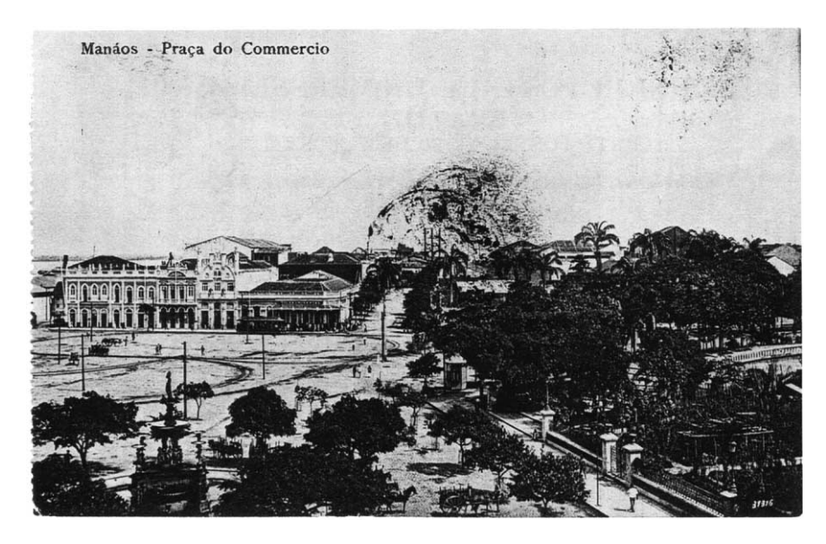
Figure 1. Manaos. Praça do Comercio

Three cards (Figures 3, 4, 5), sent in the years 1905, 1906, and 1909, depict the principal avenue, Eduardo Ribeiro. The 1905 card, a memento of the carnival festival of that year, prominently displays an electric tram with passengers in the fore-