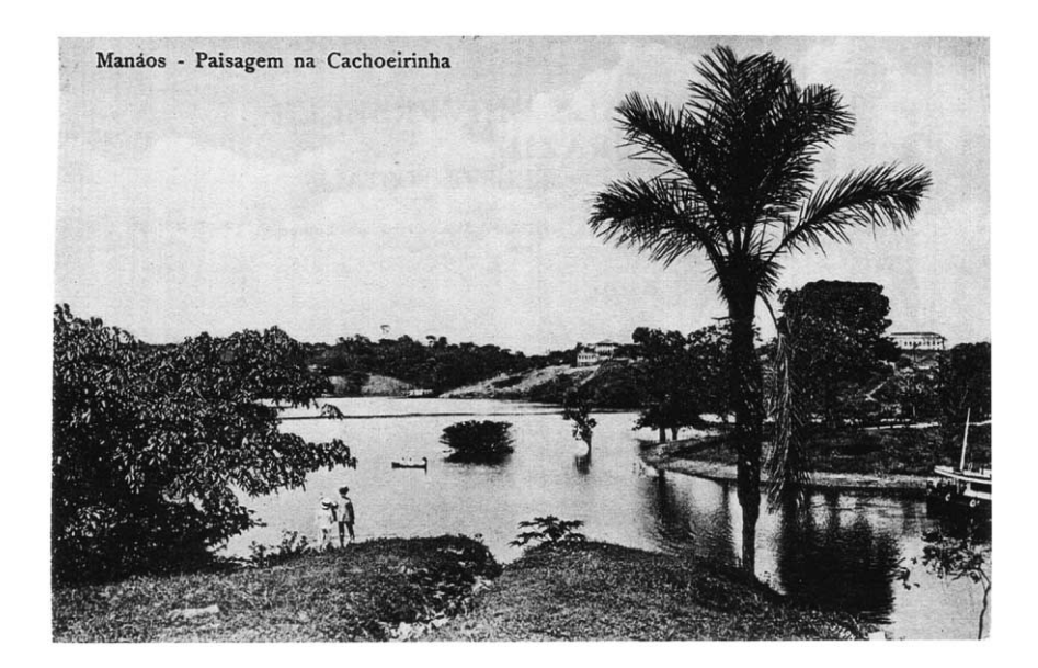
Figure 7. Manaos. Paisagem na Cachoeirinha

But if the cards were effective in presenting Manaus as a European metropole fully assimilated into the modern world, it did so at the exclusion of the majority of the