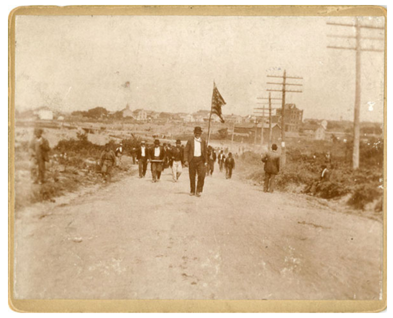
Fig. 2 Marching on Lattimer, photograph taken of marching miners, September 10, 1897

By September 10, 1897, nearly 5,000 miners were on strike in the Hazleton region. About noon, 250 men from Harwood began their march to Lattimer, about six miles away, with the goal of closing the Lattimer mines (Fig. 2). If they could stop the