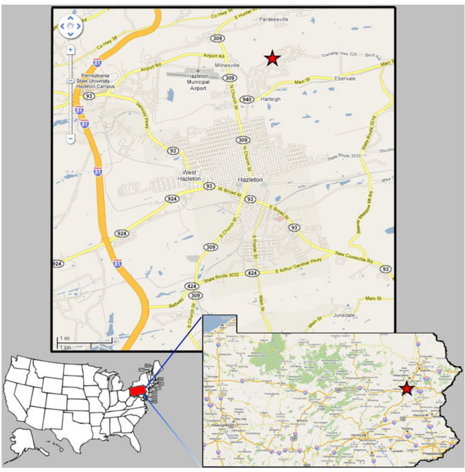
Fig. 1 Map Showing the location of Lattimer

of political extremism with them from overseas including socialism, anarchism and other forms of political disloyalty (Jaret 1999).