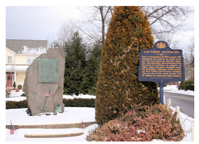
Fig. 4 UMWA monument and historic marker in Lattimer located near the site of the massacre

Thirty-two artifacts were recovered from the site including 7 bullets, 7 copper jackets and 22 brass cartridge casings. Subsequent laboratory analysis was conducted to sort out artifacts dating from the period of the massacre. XRF spectroscopic